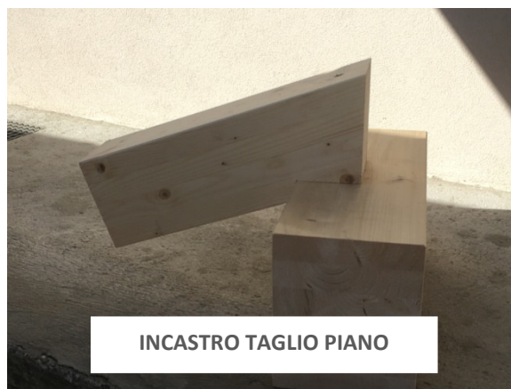
INCASTRO TAGLIO PIANO