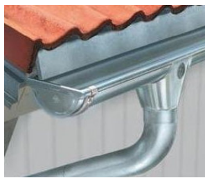
IN ACCIAIO INOX