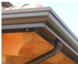
IN LAMIERA PREVERNICIATA