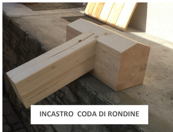
INCASTRO CODA DI RONDINE